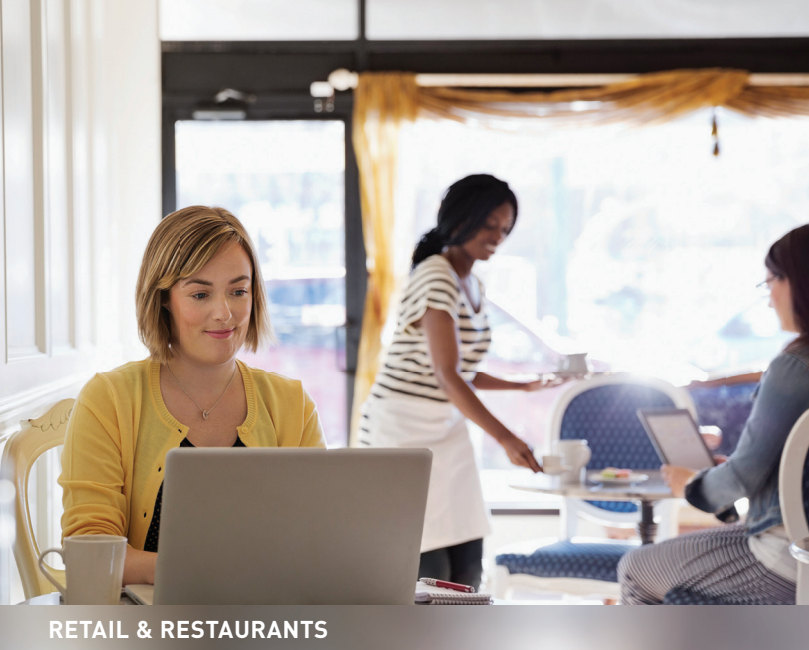
RETAIL & RESTAURANTS

A wide range of colors and finishes to match extensive color and finish options to match any décor. Create a common design theme when adorne devices and wall plates are used throughout the room.