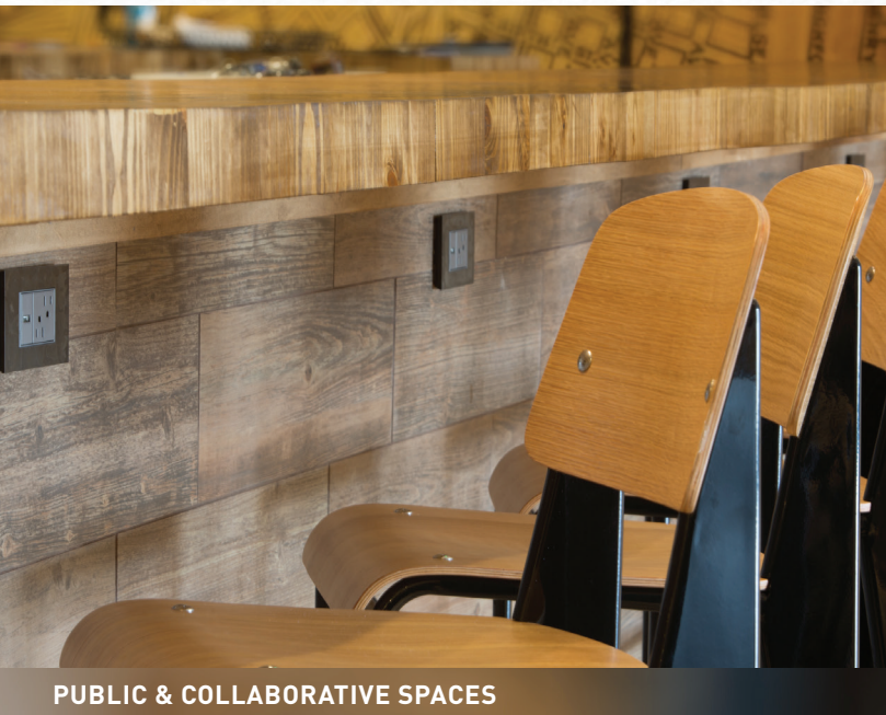
PUBLIC & COLLABORATIVE SPACES