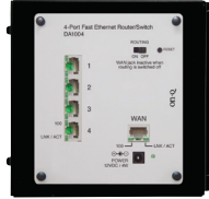
DA1004 4-Port Ethernet Router/Switch