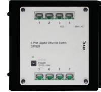
DA1008 8-Port Gigabit Switch