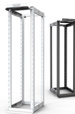
Compatible with MM20 DAB Racks